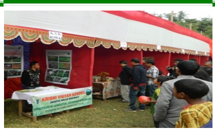
Exhibition at Wahiajer