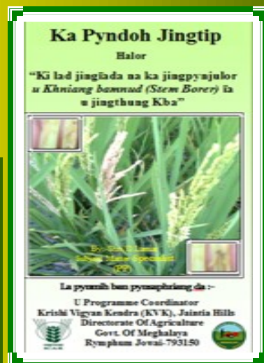
Folder on Rice Stem Borer