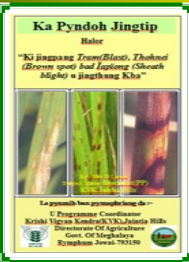
Folder on Blast, Brown spot and sheath blight of rice